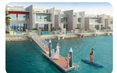
Figure 3 : Al-Naseem Villas