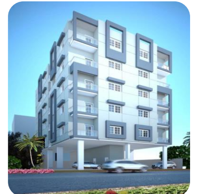
Figure 2: Aljoudi Building